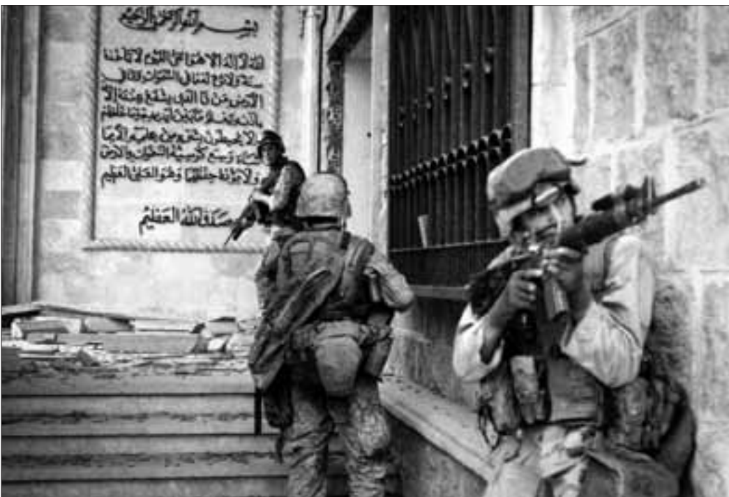
US Marines enter one of Saddam Hussein's palaces in Baghdad, Iraq

True love of country means rising above the prevailing unjust and immoral attitudes of the day and bucking the system for the ultimate good of one's country and one's fellow citizens.