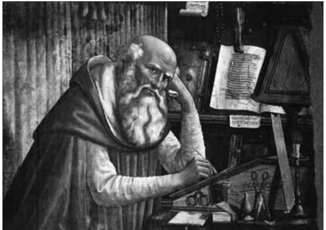
Saint Jerome, Father and Doctor of the Catholic Church

“When my soul was on fire with bad thoughts, that I might subdue my flesh, I became a scholar to a monk who had been a Jew, to learn of him the Hebrew alphabet...”