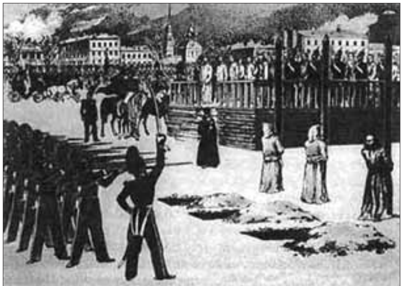
Dostoyevsky’s mock execution in 1849

There are also other things he does not reveal to his friends, but at best to himself and only under a pledge of secrecy.