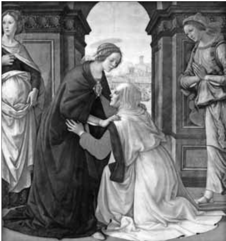
The Visitation, by Domenico Ghirlandaio

Our Lady distinguishes here her spirit from her soul. Her will, that is, her spirit , rejoices in Him whom her soul, that is, her intellect , magnifies. "May the soul of Mary be in each one of us to glorify the Lord," exhorts Saint Ambrose, "and may the spirit of Mary be in each one of us to rejoice in God." This