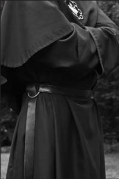
Hand-made monastic leather belt.

Put me as a seal upon thy heart, as a seal upon thy arm... . (Cant. 8:6)