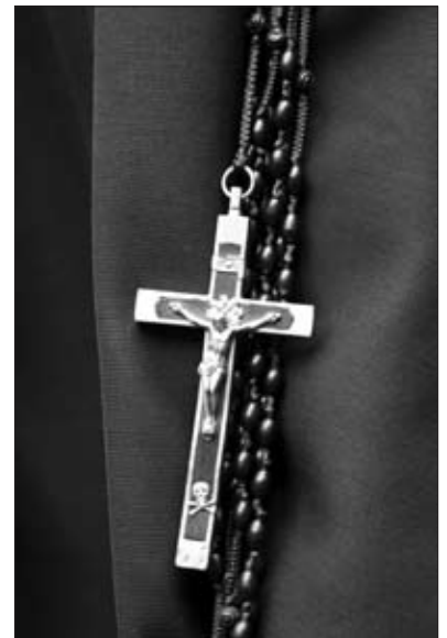
Crucifix imported from France; rosary hand-made by our sisters.