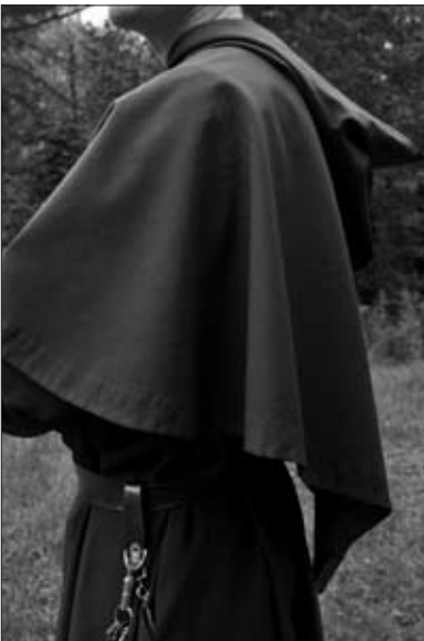
The capuche, or monastic cowl, is the hood with the small cape to which it is attached.

The Tunic: O Lord, clothe me with the angelic habit and make me a new man, who according to God is created in justice and holiness of truth.*