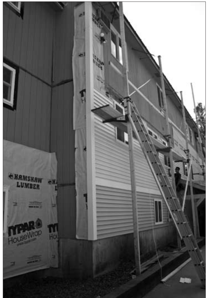
Saint Paul's house upgraded with new siding and windows