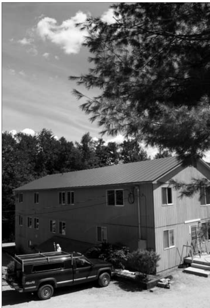
The new roof on Saint Paul’s house