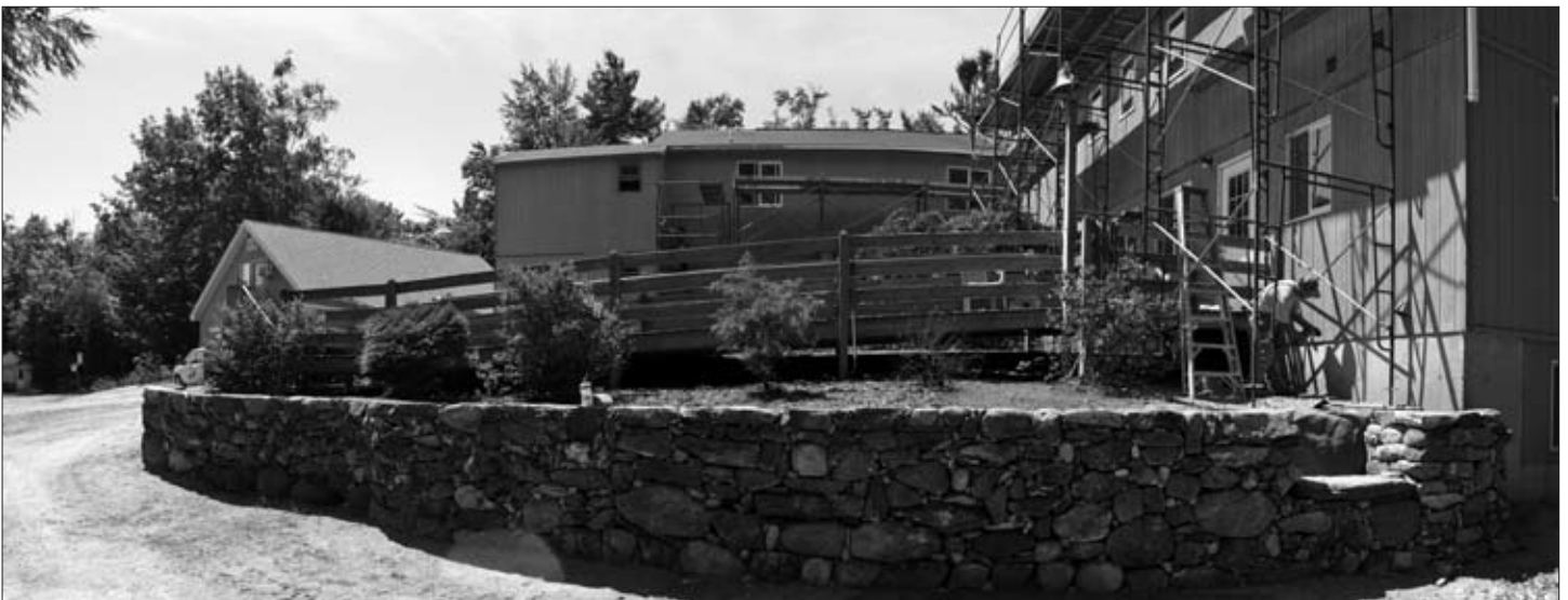
This is one of the rock walls that Russell LaPlume built. The niche on the right side is for a statue, yet to be procured.

What does it mean to say that we are “against liberalism in religion” but “for liberal education”?