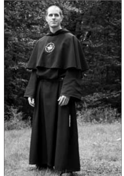
The tunic is the main garment.

* Text taken from the clothing prayers the brothers recite when dressing. Each garment is first kissed.