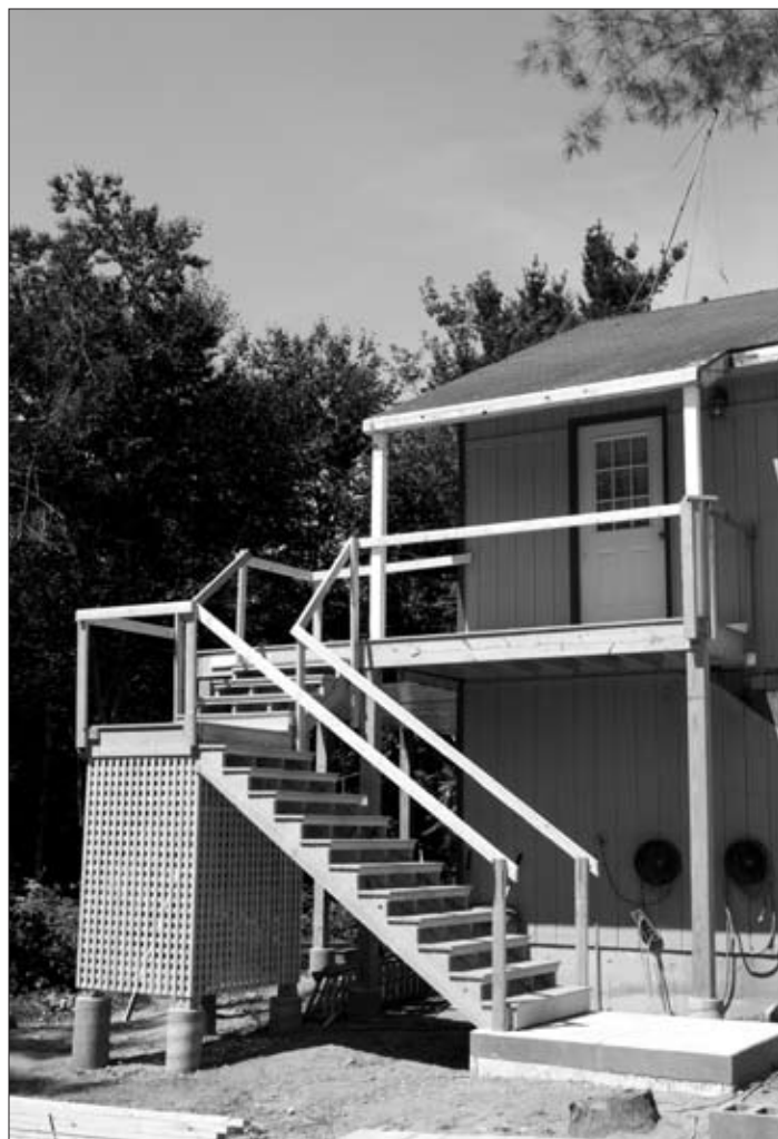
Improved entrance on Saint Joseph’s Hall (with temporary handrails)