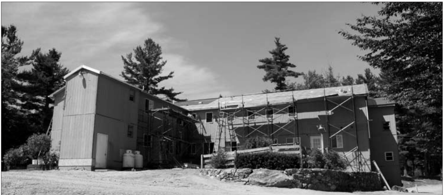
Saint Paul's House with the new rock wall and the metal roof being put on. The landscaping is still a work-in-progress.

Leo XIII, in his two famous encyclicals, confirms the condemnation given by Pius IX in the Syllabus , maintaining vigorously the rights of God and of the Church with regard to the individual and the State, which cannot divest itself of interest in the religious problem or put the Catholic Church on a par with other cults. But, in consideration of contingent difficulties, he does not condemn the government which, for reasons of freedom of conscience, permits in its territory — even where the majority of citizens is Catholic — the free exercise of other religious forms. This is a tolerance, therefore, of practical necessity, similar to that with which God tolerates evil by the side of good in the world; but the principle remains intact, namely: the truth and the right of the Catholic religion and Church in its relations with the individual, with society, and with the State.